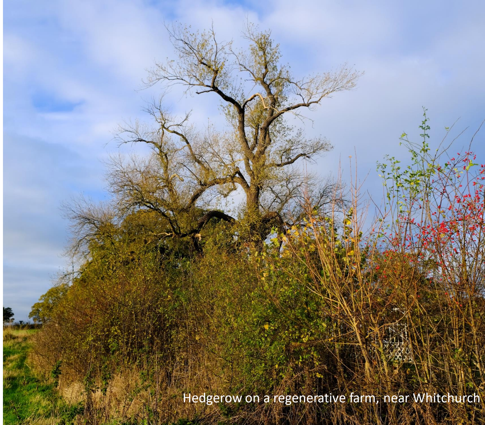
Hedgerow on a regenerative farm, near Whitchurch