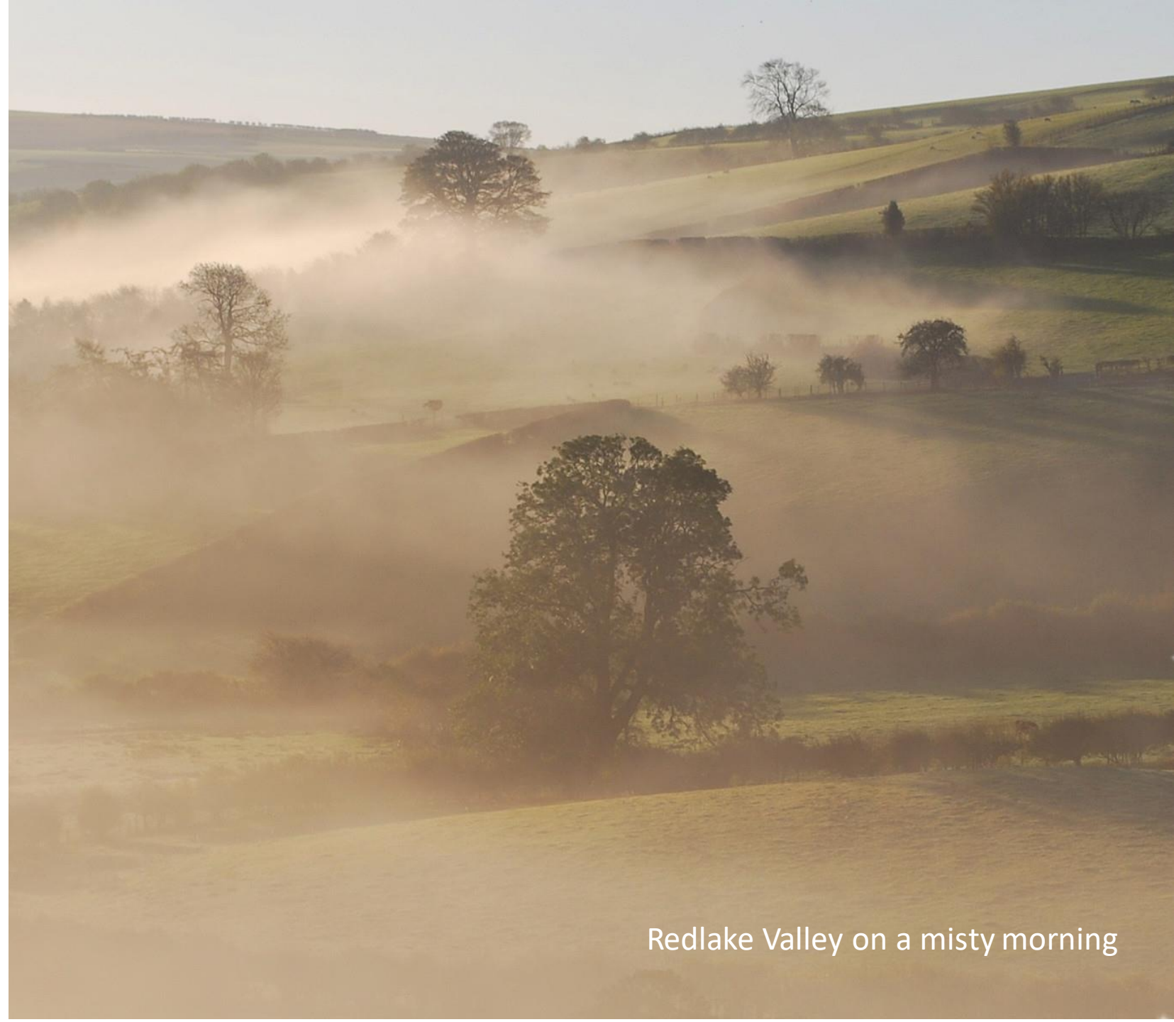
Redlake Valley on a misty morning