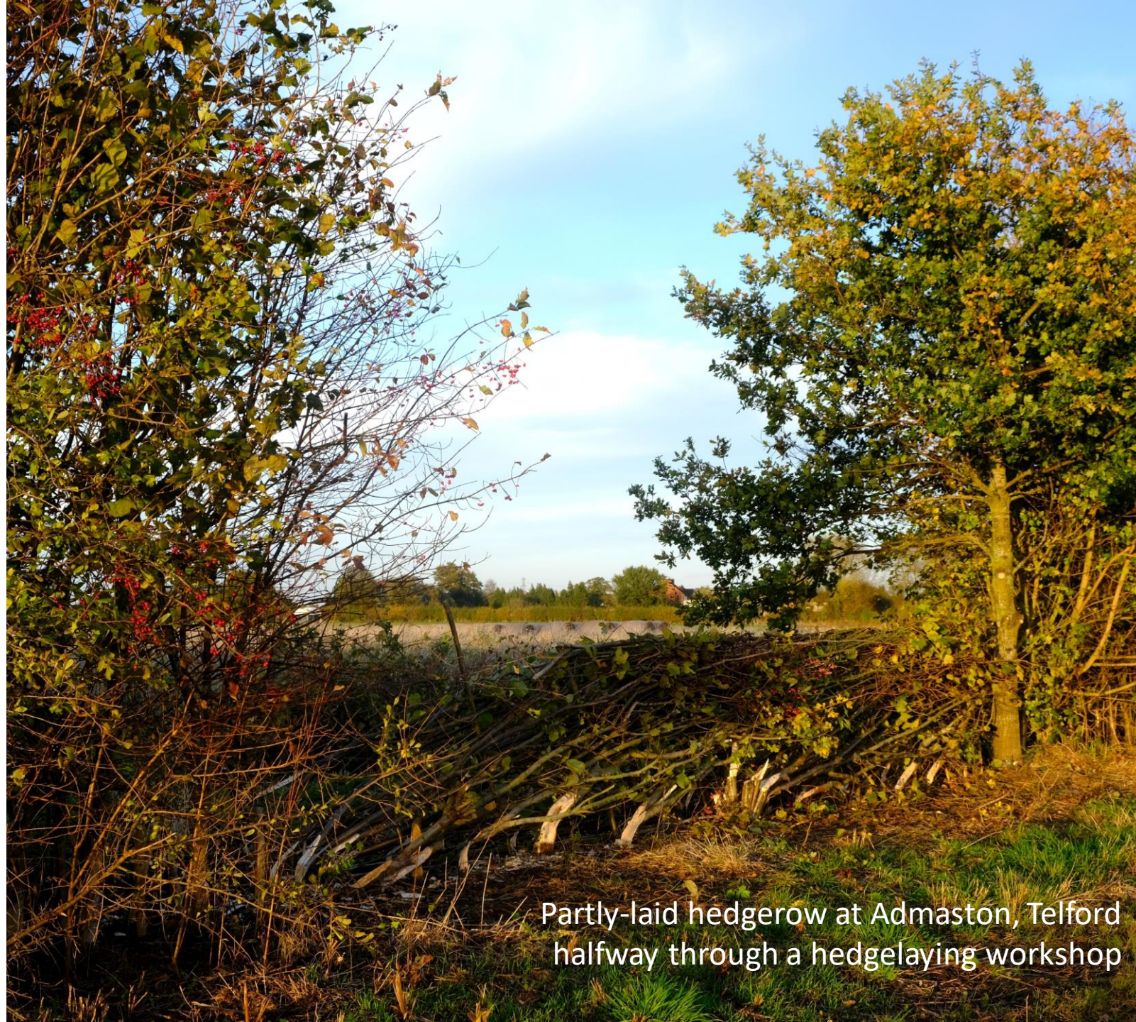
Partly-laid hedgerow at Admaston, Telford halfway through a hedgelaying workshop