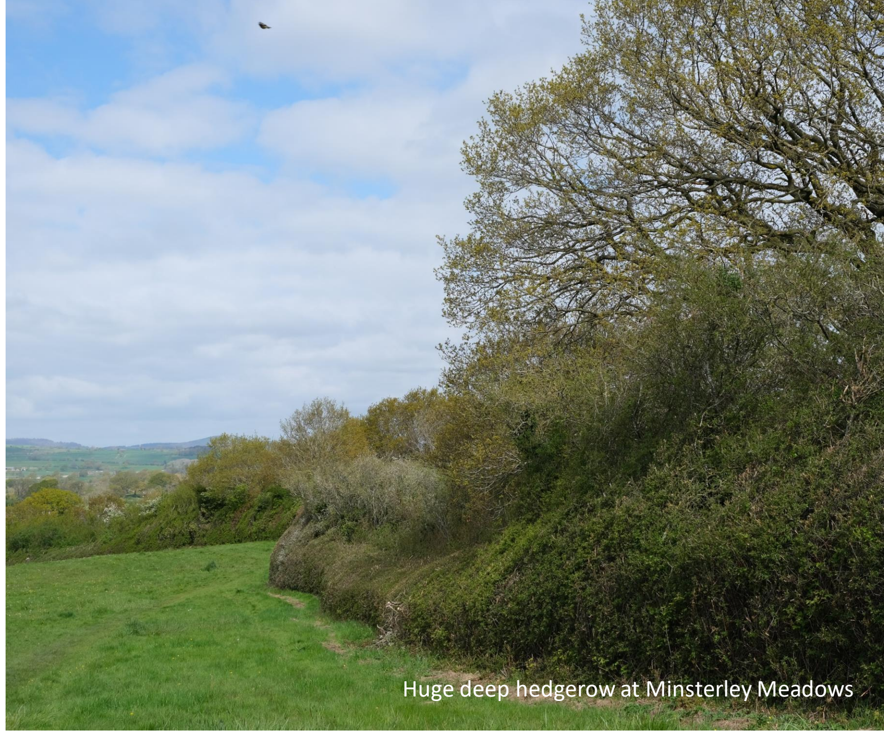
Huge deep hedgerow at Minsterley Meadows