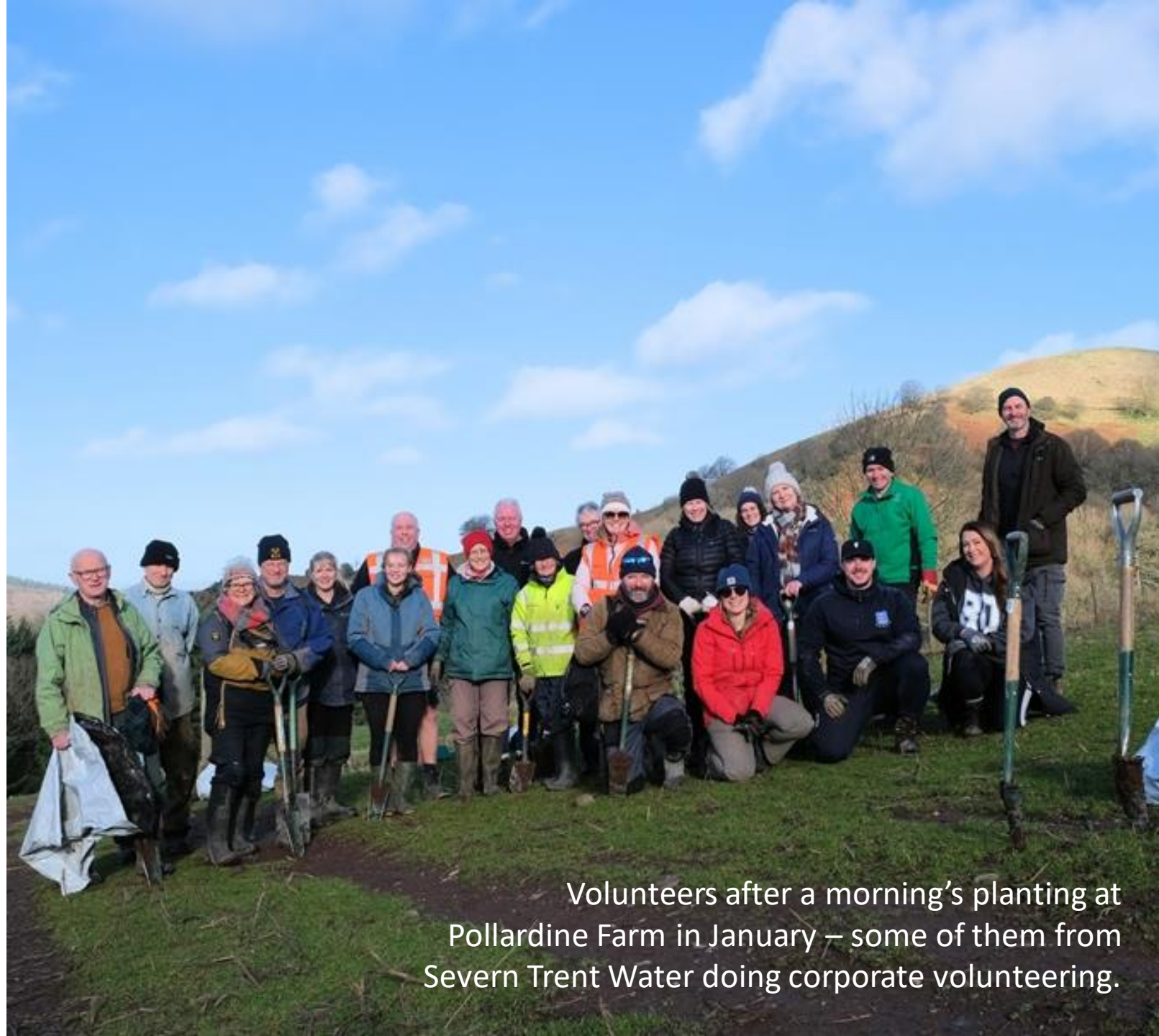
Volunteers after a morning's planting at Pollardine Farm in January – some of them from Severn Trent Water doing corporate volunteering.